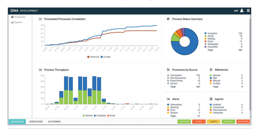
ASG-Zena dashboard showing a Scheduler summary

ASG-Zena<sup>TM</sup> is a robust, workload automation solution for multi-platform environments that supports both event-based and date-and time-based scheduling. It provides exception-based management and role-based security and is architected for scalability and high availability. ASG-Zena enables the management of workloads across multiple operating systems including Windows, UNIX, Linux, AS/400, and z/OS in both physical, virtual and cloud environments. ASG-Zena offers a cluster-based fault tolerance model that allows the workload to be executed on multiple backup servers in a fail-over scenario.